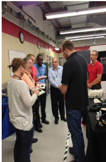
Perry showing an example of direct digital manufacturing